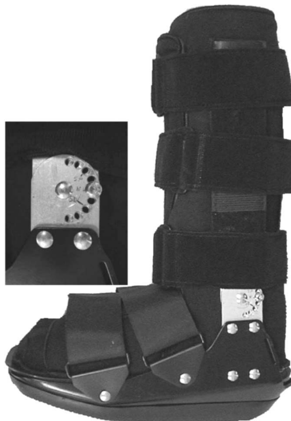
Fig. 1: The modified Bledsoe Diabetic Conformer Walking Boot used in the study. The small insert picture demonstrates the ankle adjustment mechanism.

Custom-modified walking boots from Bledsoe Brace Systems (Grand Prairie, TX) were used in this study. The company's standard Conformer Diabetic Walking Boot was modified to allow an adjustable ankle angle. A hinge was added at the bottom of the upright supports of the boot to allow it to be set at various degrees of plantarflexion and dorsiflexion, in 2.5° increments (see Fig. 1). For this study, subjects were tested in three conditions: the standard neutral angle of a 90° angle between the foot and the tibia, 5° of plantarflexion, and 5° of dorsiflexion.