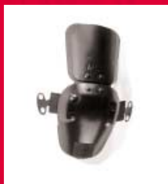
Optional Patellar Guard

Off-the-shelf brace that fits like a custom