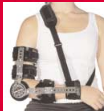
Original Arm Brace

Alternative to casting or splinting with range of motion